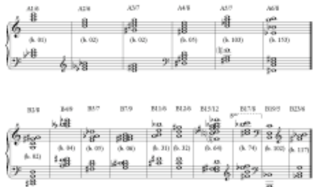
Figure 3: Some A- and B-category chords. Above the staff: our labeling (2d integer informs the chord's number of pitches); inside: bar number.

The chords heard at the first moment of the piece, are in fact a number of instances of the two main sonic categories which will constitute the core of the musical kinesic. The first category (we label A) is a 'bi-triadic' vertical structure, built upon two superposed major, minor, augmented or diminished triads. The objects of this category tend to feature a resonant, if not consonant, sound design. Some of them may have an added 7th and/or 9th, which reforce this resonant (harmonic) trend. On an opposite way, the second (B) category objects are rather based upon chromatic relations, with a large amount of seconds and fourths, which make them undoubtedly inharmonic, 'anti-resonant', almost 'noisy' (see fig. 3 some samples of both categories of chords).