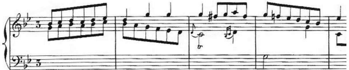
Figure 3 : The score of the first 7 seconds of "L'indifférente"

The first 7 seconds of "L'indifférente" and their analysis are presented in figure 2. The initial beat level which has been chosen corresponds to the eight note of the score.